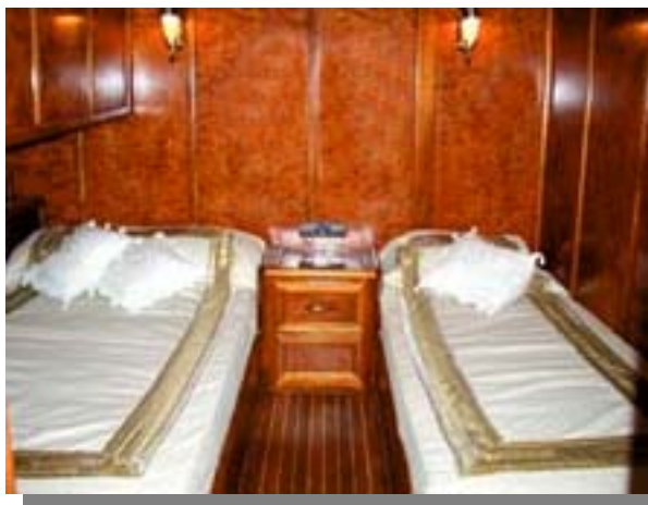
Double Cabin with 2 Single Beds